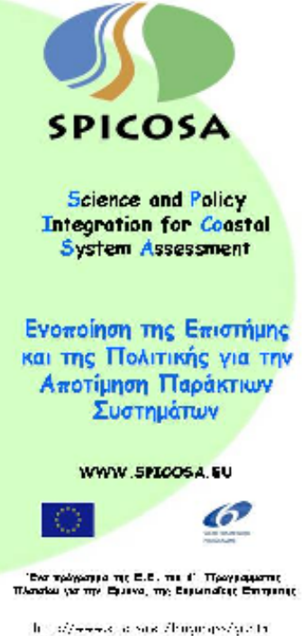
Figure 1: Outside of the Greek SPICOSA leaflet

Η στοχείοματα τη επιστηγή δύου τη 4 κατή της παρχατία τη της χρηγηρικής του στο της χηρχητήρος και διατικής του 31 χ. μας τη τη της της τη τη του παράτης χρηστη του 3 Ηδορί δου τη τη τη τη τη θαλα του τη χείνης